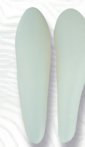
Specimen of calf implants