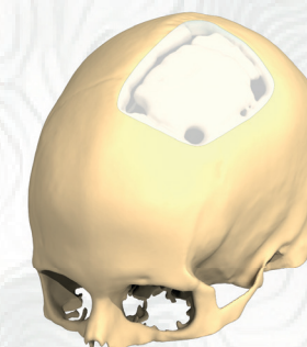
Specimen of skull with implant